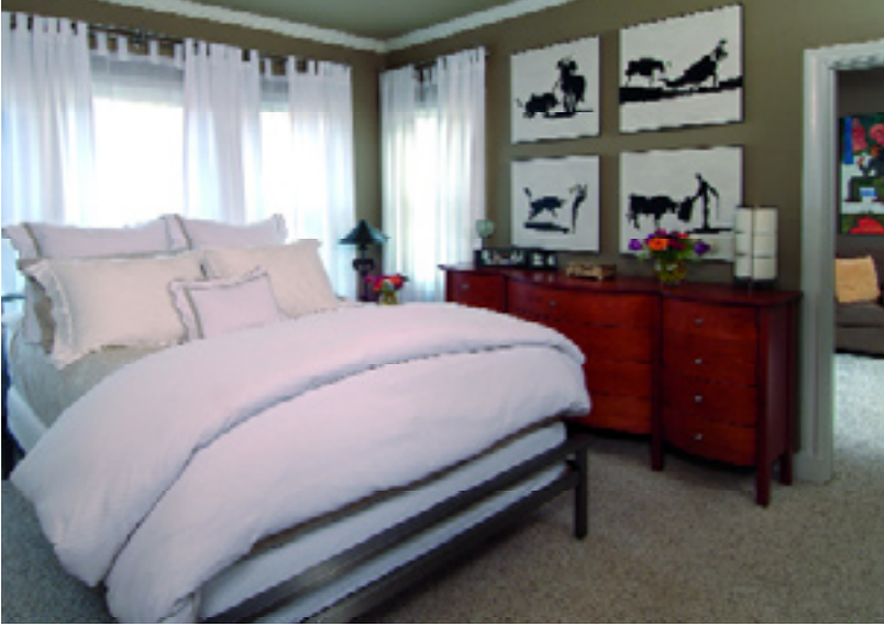
TOP Homeowners Glenn and Heather Comtois have the rare ability to work together on a remodeling project and love it. They painted the colorful living room, filled with Glenn's old masters reproductions, five times before they agreed it was right. LEFT The massive concrete-topped dining table is another Comtois original. ABOVE Glenn's rendition of a pen & ink bullfighter series by Picasso provides a focal point for the neutral, soothing tones of the master bedroom.